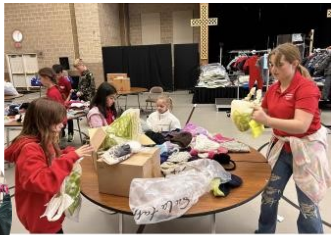
The West Clay Elementary School Compass Leadership Team volunteering bundling hats and gloves. Kids Coats Carmel giveaway - Nov 4, 2023