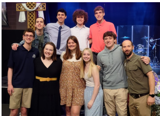
All 2022 Graduating Seniors

Advertising /Outreach Fund – The fund was used to support the following three important items: (1) the use of Optima (Google search engine) that keeps information about the church up to date as well increasing CUMC awareness during internet searches, (2) support for the use of ads about CUMC in the Carmel Current Newspaper and (3) the purchase of Easter banners placed at the front of the church.